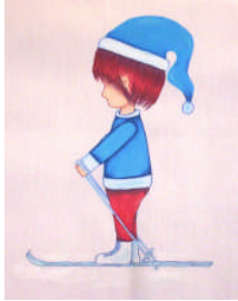
BOY08 - 01