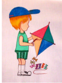
BOY08 - 03