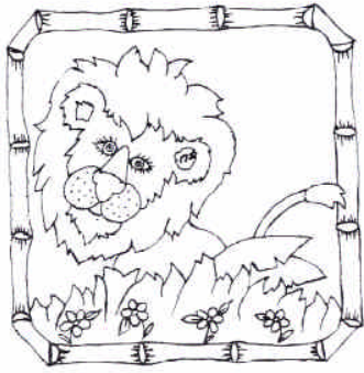
Animal Quilt Block-AQ01