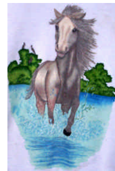
T4242-Wild & Free