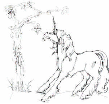
Unicorn Quilt Block-UQ01

(Sorry they're not in color. I'll try to get them to the printers faster this month)