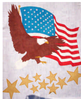
T0802-Eagle & Flag