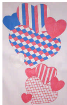
T4661-Hearts On Display