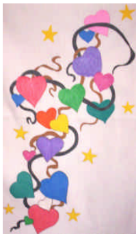
T4385-Hearts & Stars