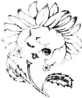
Flower Face Quilt Block-FFQ01