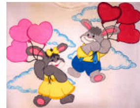
T4663-Bunnies & Balloons