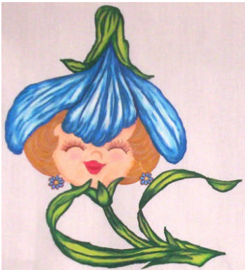
Flower Face 2 Quilt (FF2-02)