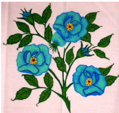
Rose Quilt (RQ-02)