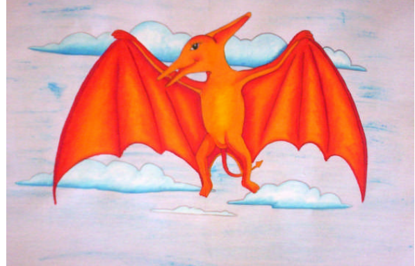
Dinosaur Quilt (DQ-02)