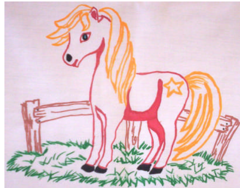
Pony Quilt (PQ-02)