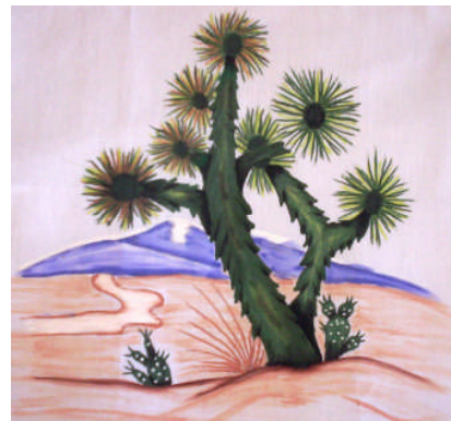
Southwest Quilt (SW-02)

Ginger's Cameo – 4879 Sylvan Rd. – Manchester, MI 48158 Phone: 734-428-1344 emails: ginger@gingerscameo.com