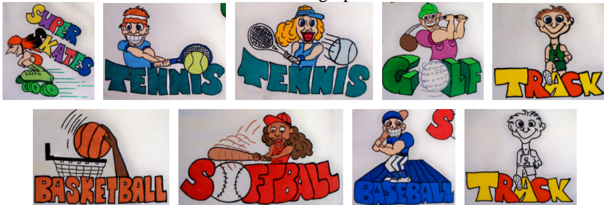
T5053 – Smiling Sportsters

The second one – T5054 is just a nice variety of small transfers. These can be used on towels, baby clothes, pockets, I did part of them on blue jeans, jackets, curtains, pillow cases, sheets – you name it you can probably find one that is just right for what you want. There are over 30 different transfers in this Pak.