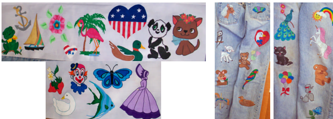
T5054 – Variety Pak

As you can see – I'm very visible in my painted jeans.