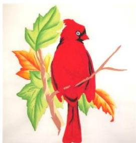
Bird Quilt BQ01