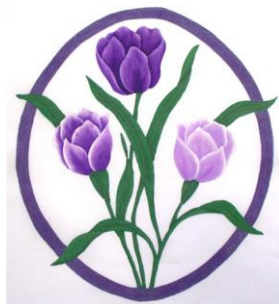
Flower Garden Quilt FG01