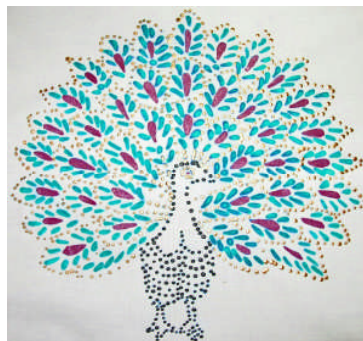
T4824-Peacock in Dots