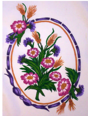
T4817-Oval Still Life