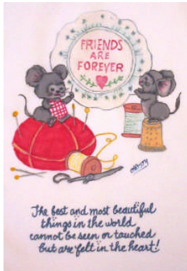
T4816-Friends are Forever