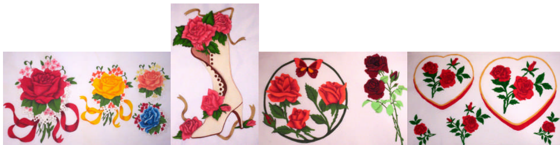
T5050-Rose Designs (All 4 of these transfers come in this Pak) for $5.25