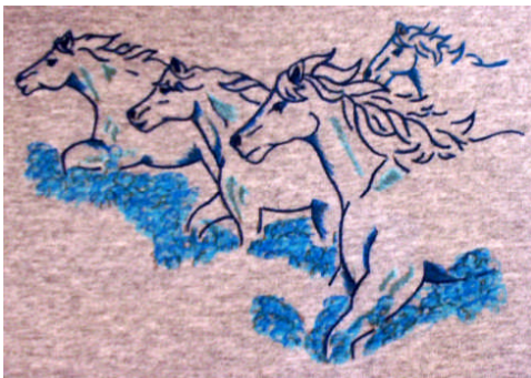
T4819-Against the Wind