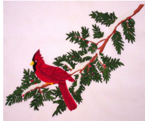
T4818-Cardinal in Winter