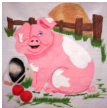
T4628-On The Farm – Pig