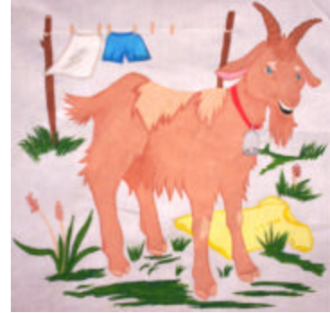
T4624-On The Farm – Goat