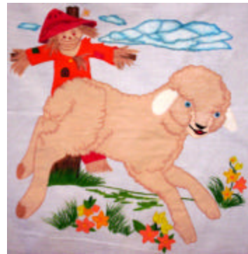
T4627-On The Farm-Lamb