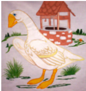
T4625-On The Farm-Goose