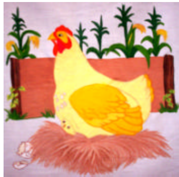
T4626-On The Farm – Hen