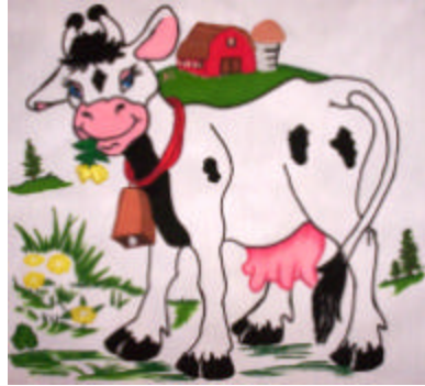
T4623-On The Farm – Cow