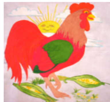
T4630-On The Farm-Rooster