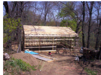
It looks like a building is coming!!

It really is moving right along. I just keep thinking about how much still has to be done before the Cameo Facility is up-graded to usable.