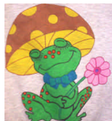
T4668-Hermit the Frog