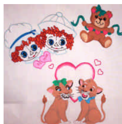
T4670-Be My Valentine