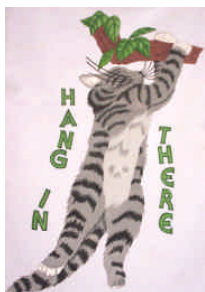
T4455-Hang In There