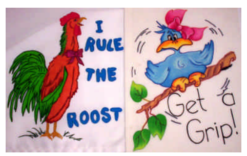
T4658-Grip & Rule