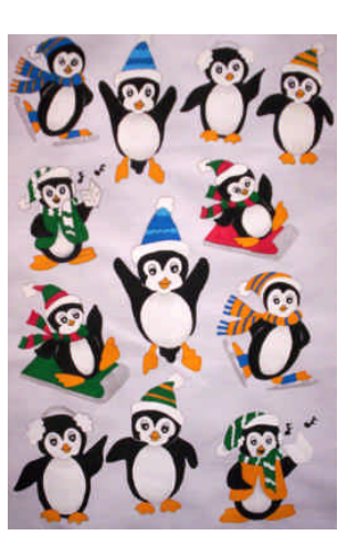
T4656-Mr&Mrs&Friends T4660-Playful Penguins