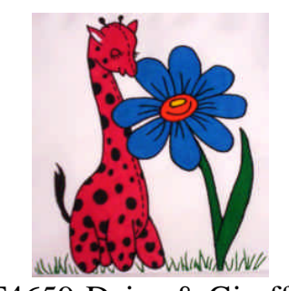
T4659-Daisy & Giraffe