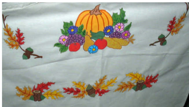
T4750 – Thanksgiving Towel