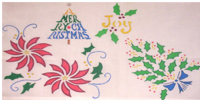
T4753 – Simply Christmas