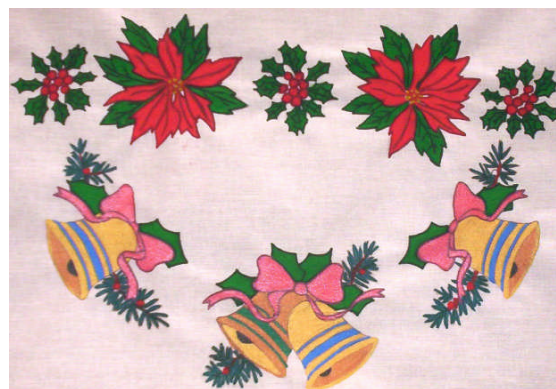
T4751 – Christmas Towel