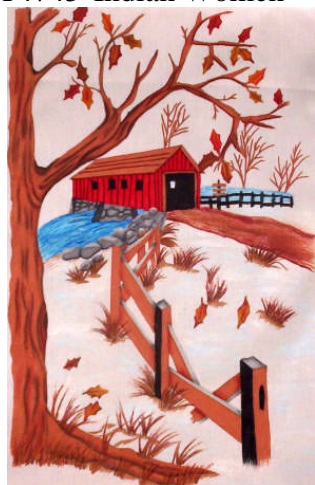
T4747 – Winter Crossing