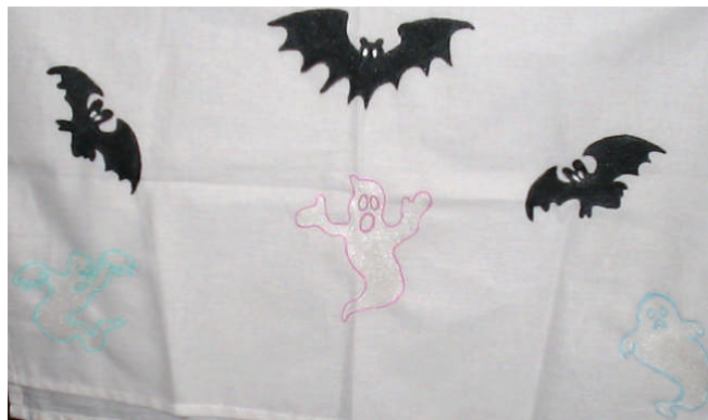
T4749 – Halloween Towel