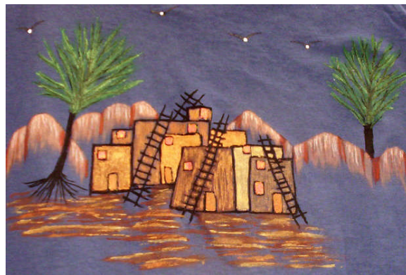
T4746 – Dwellings