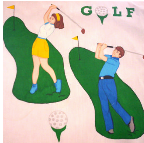
T4459-Tee Off Time