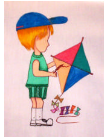
BOY08 - 03