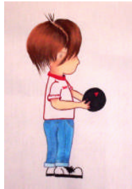
BOY08 - 02