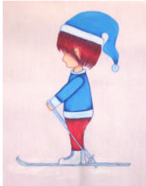
BOY08 - 01