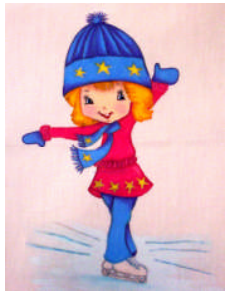
GIRL08 – 01