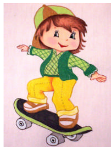
GIRL08 – 03