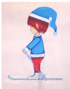
BOY08 – 01