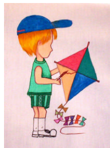
BOY08 – 03