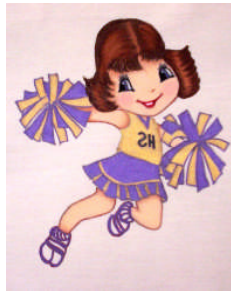
GIRL08 – 02