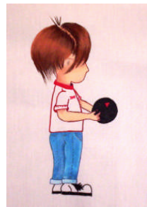
BOY08 – 02