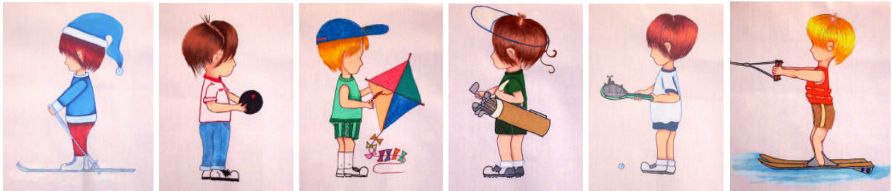
BOY08 - 01