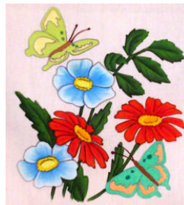
T4768-Flowers &amp; Butterflies