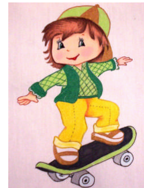
GIRL08 - 03

Order in: ones=$2.50 (1 quilt block & 1 transfer) {or} sixes=$15.00 (6 blank quilt blocks & 6 of same transfer)