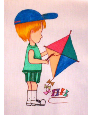
BOY08 - 03