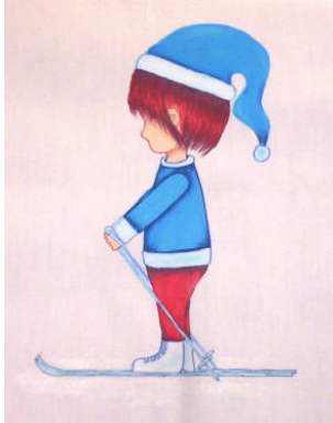
BOY08 - 01

You can buy all of these right now. As each quilt of the month comes out it is added to the ones that are already out, so if you haven't started getting your quilt blocks of the month before, you can catch up at any time.