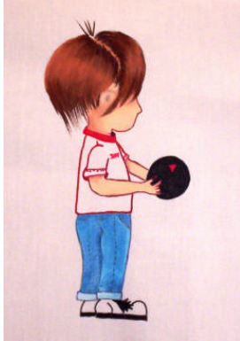
BOY08 - 02