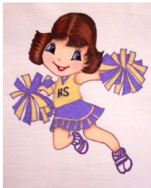
GIRL08 - 02