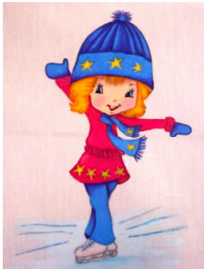
GIRL08 - 01