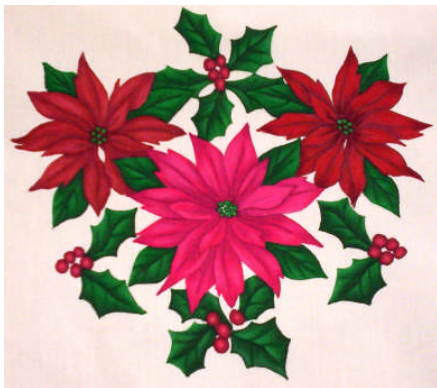
T4743 - Poinsettia Center