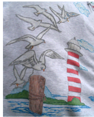
T4741 - Seascape