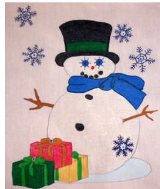
T4744 - Gifted Snowman