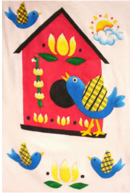
T4350 - Birdhouse