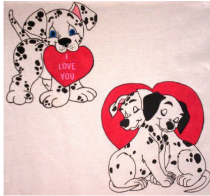
T4441 - Dalmatians