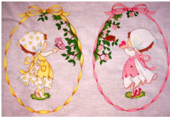
T4513 - Spring/Summer