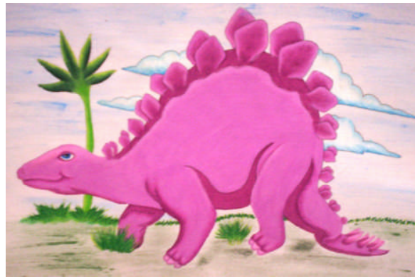
Dinosaur Quilt (DQ04)