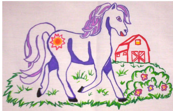
Pony Quilt (PQ04)