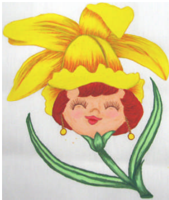
Flower Face 2 Quilt (FF2-04)