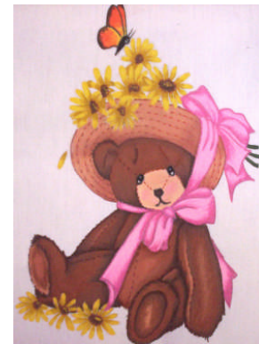
T4727-Easter Bonnet Bear