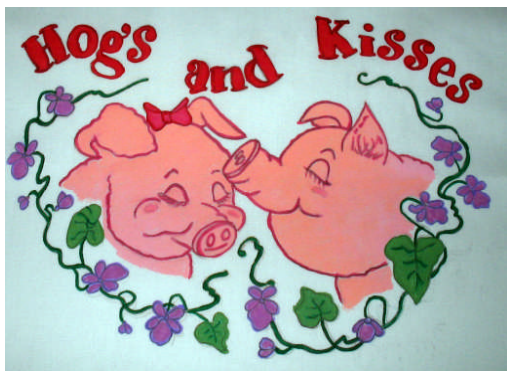
T4050 – Hogs & Kisses