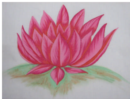
Southwest Quilt (SW04)

Order is ones = $2.25 (1 Blank quilt Block & 1 transfer {or} sixes=$13.00 (6 blank quilt blocks & 6 of same transfer