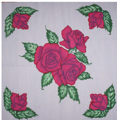
Rose Quilt (RQ04)