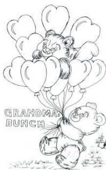
T4732-Grandma's Bunch (I lost the picture and sent the shirt home with Halleen. It's really colorful.)