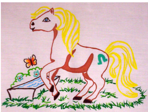
Pony Quilt (PQ-01)