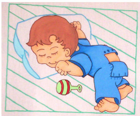
Baby Quilt (BQ-01)