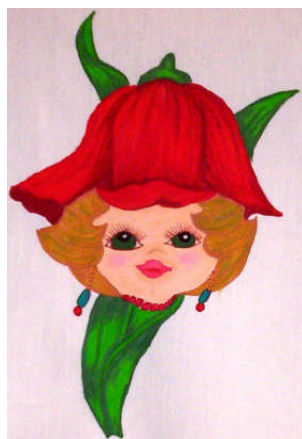
Flower Face 2 Quilt (FF2-01)