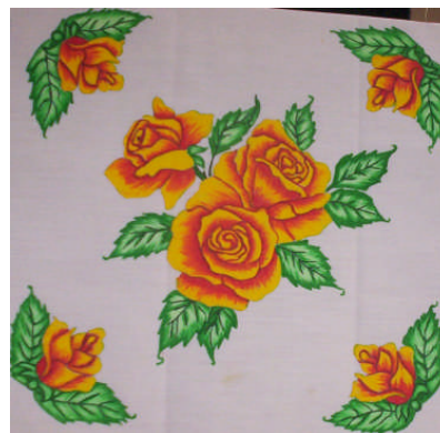
Rose Quilt (RQ-01)