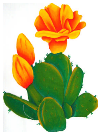
Southwest Quilt (SW-01)

Order in: ones = $2.25 (1 blank quilt block & 1 transfer) [or] sixes = $13.00 (6 blank quilt blocks & 6 of same transfer)