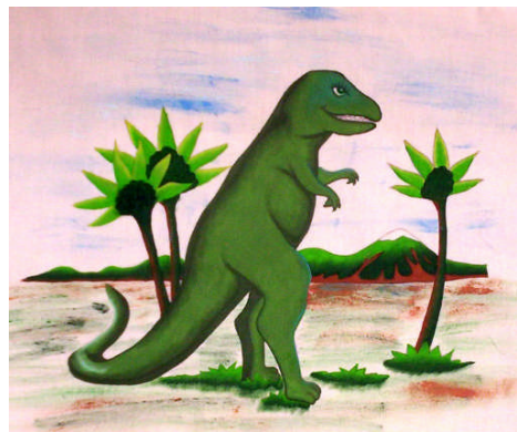
Dinosaur Quilt (DQ-01)