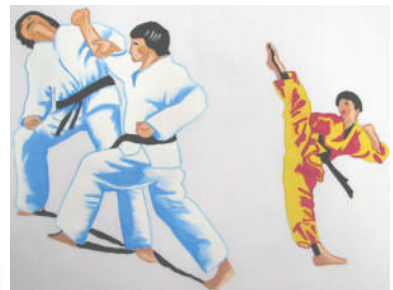
T4712-Exercise & Defense