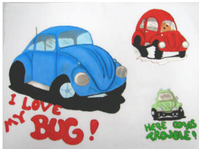
T4710-Love A Bug