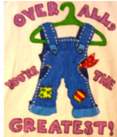
T4601-The Overall Greatest