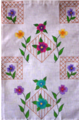
T4600-Wild Road Flowers