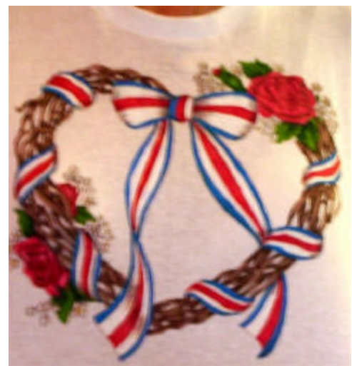
Best of Show