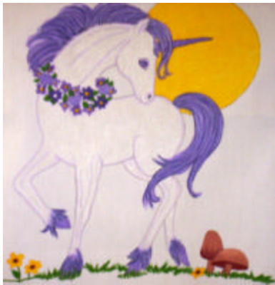
T4595 – Prancing Unicorn