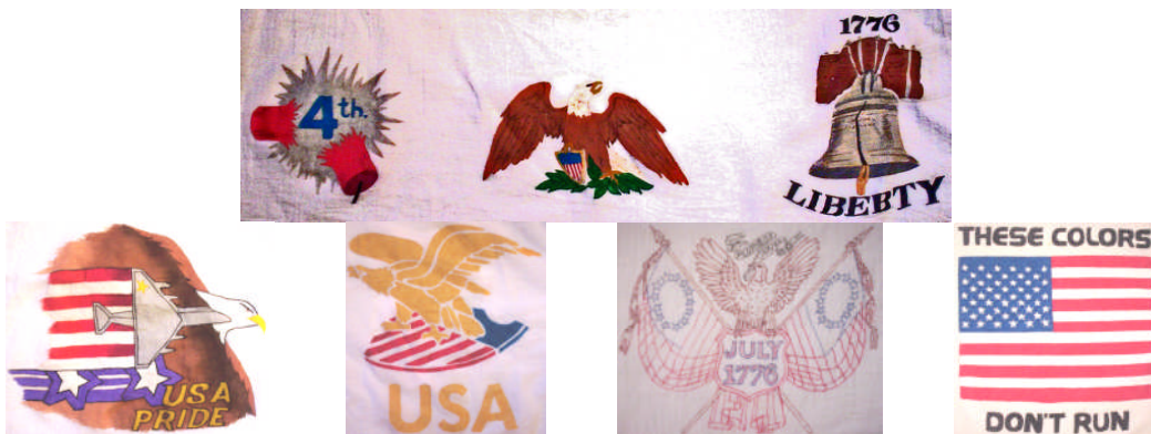
T5060 - USA