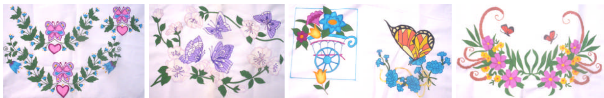
T5070 – Florals & Butterflies