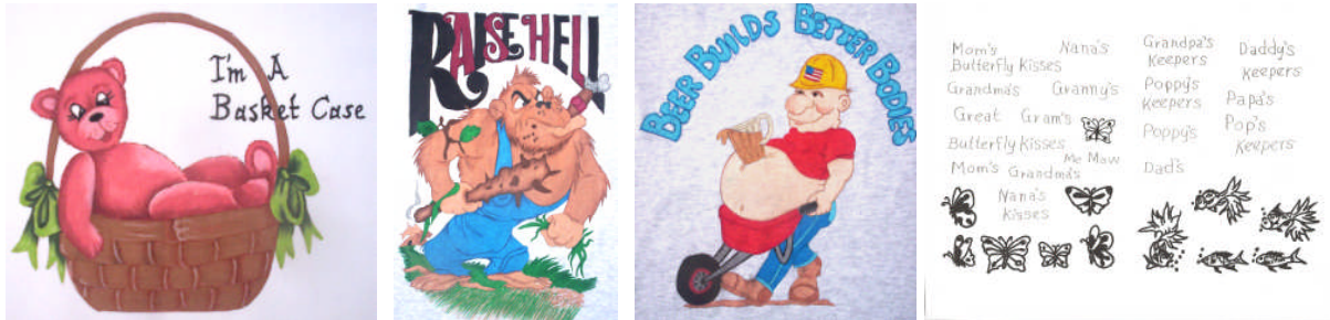
T5069 – “Say What?”

($5.75 for each Pak of multiple transfers)